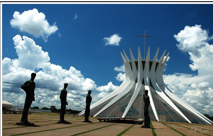
Views of the cathedral in Brasilia